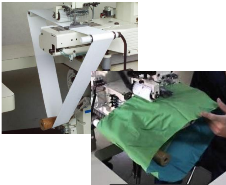
Elastic expanding device for FX models (inclusive in machine purchase)