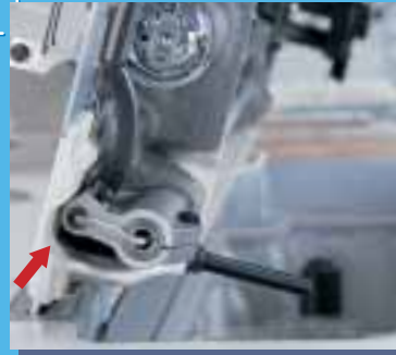
Feed eccentric pin

In addition, the machine is provided with a mounting seat for attachment to improve workability while replacing the attachment and increasing the durability of the machine bed surface.