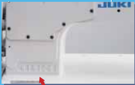
Embossed JUKI mark